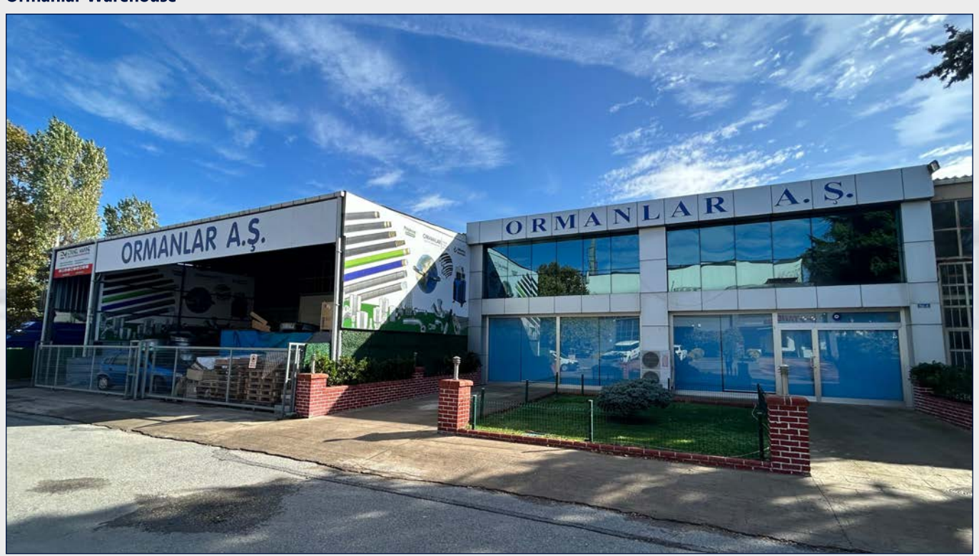
Ormaniar Hose Assembly Center